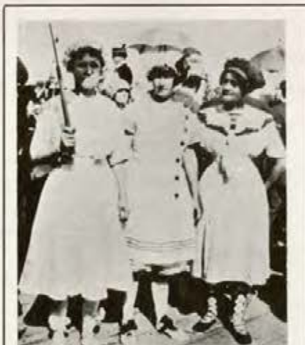
BATHING BEAUTIES they were called, when these three became finalists in the first beauty contest ever held at Venice back in 1906.

Titles of the winners, who will serve as publicity hostesses in Marina del Rey and surrounding communities during 1968, will be Misses: Marina del Rey, Venice, Mar Vista, Playa del Rey, Industry, and Small Craft Harbor.