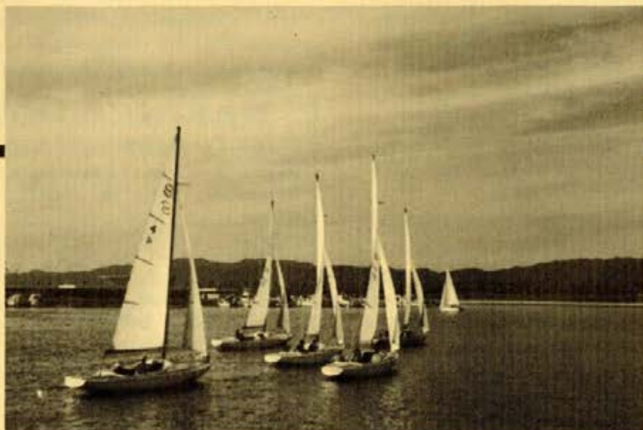
Larry Bartlett—Fleet Captain of the Del Rey Schock 25 Fleet leads the flock past the new Del Rey Yacht Club

Please send in computed results as soon after a race as possible. Address: 13011-A Washington L.A. 90066 Phone: 398-4472