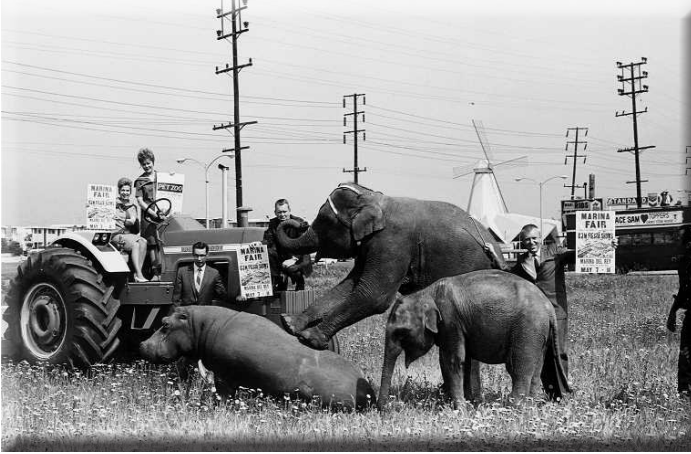
Marina Fair (site of TriZec buildings), 1966

An event intended to attract the public's attention to the location of the marina was a mini-zoo exhibit. It occupied the empty parcel between Admiralty Way and Lincoln Boulevard and between Bali Way and Mindanao Way. The windmill building in the background, the iconic symbol of the Van deKamp Bakeries, stood on the east side of Lincoln Boulevard.