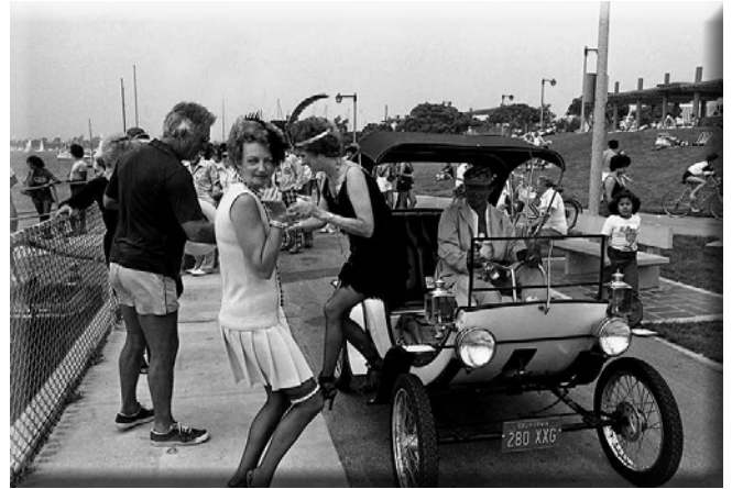
Old Fashioned Day in the Park, July 20, 1980

An event intended to attract the public's attention to the location of the marina was a mini-zoo exhibit. It occupied the empty parcel between Admiralty Way and Lincoln Boulevard and between Bali Way and Mindanao Way. The windmill building in the background, the iconic symbol of the Van deKamp Bakeries, stood on the east side of Lincoln Boulevard.