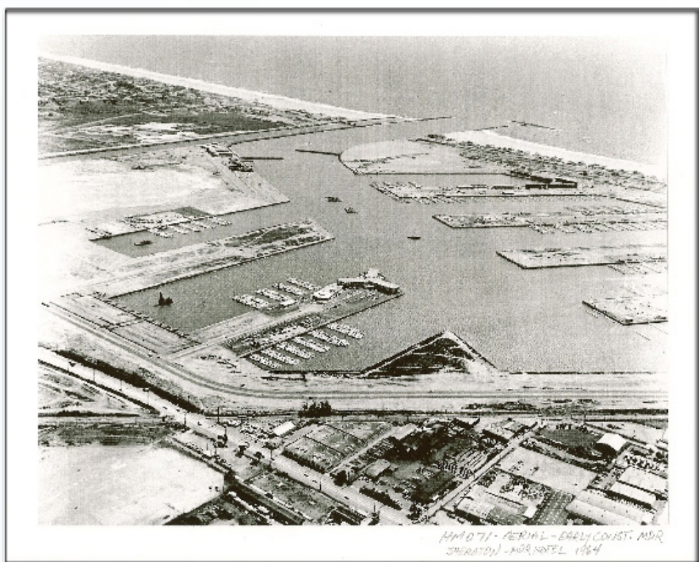
An aerial view Marina del Rey in 1964, shows the early development of the Sheraton (MdR) Hotel (center), construction Pieces of Eight (upper left) now Whiskey Reds, the future site of the California Yacht Club (lower right) and the temporary seawalls/baffles in place during construction of the breakwater (upper right).

After 75 years and various starts and stops the dredging of Marina del Rey --- at that time the largest man-made small craft harbor in the country --- was completed in May 1962. Winter, however, would bring yet more challenges. Violent storms, on February 9 and 10, 1963, sent nine foot swells into the channel destroying boats and docks. The Army Corps of Engineers later installed seawalls across the channel near Fisherman's Village to prevent any further damage, but this would be just a temporary fix. At an Army Corps facility in Vicksburg, Miss., a large-scale model of the marina was constructed in order to simulate wave action so that a barrier could be designed and developed for the marina. Eight months after, what became known as "the surge" nearly destroyed the marina, funding was acquired to fix the problem. In October