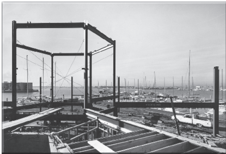
Construction begins at the California Yacht Club, on Admiralty Way