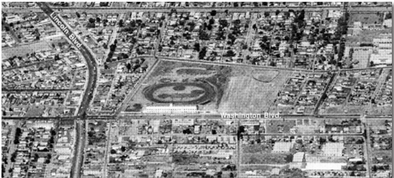
Culver City Race Track, Lincoln and Washington, circa 1930s