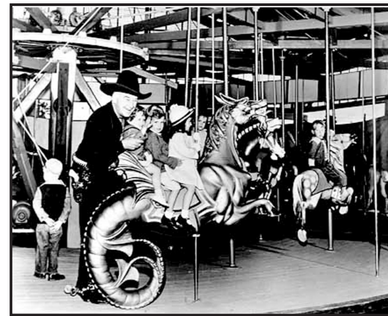
Children on a Hoppyland Seahorse Merry-go-round (with Boyd), circa 1949

The year before he retired, Boyd made 40 Hoppy episodes. Bill Boyd's TV success