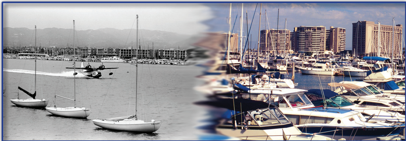
Marina del Rey, circa 1968, and the Marina today